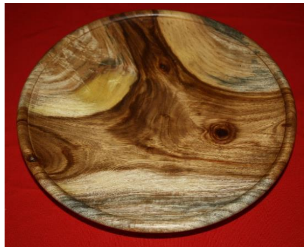
'n Kiaatbord deur Alan Crawford. Die hout is van 'n mik in die boom afkomstig. / A kiaat platter by Alan Crawford. It was turned from crotch wood.