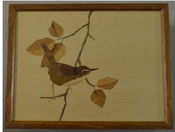
Neville Comins has taken up marquetry again after a lapse of about 40 years!

A few other members made short interventions.