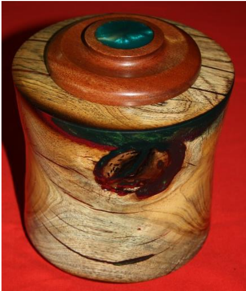
'n Interessante pot deur Gerrie Grobler van knoppiesdoringhout wat met hars geïmpregneer is, en sy meranti-deksel met ingelegde hars. / Interesting pot by Gerrie Grobler from knob tree wood, impregnated with blue resin, and a meranti lid.