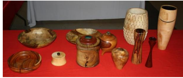
So het die skraal oes op die huiswerktafel gelyk. / The homework table showing the small number of items.