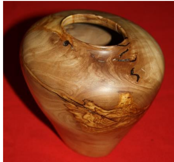
Alan Crawford se besondere vaas van olienhout – 'n goeie voorbeeld van ovaal-draaiwerk. / Alan Crawford's exceptional wild olive vase – a good example of oval turning.