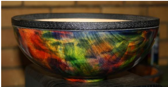
Die bak is volledig gekleur en die kleure is netjies ineen-vermeng. / Staining of the bowl is finished with the colours blended in beautifully.