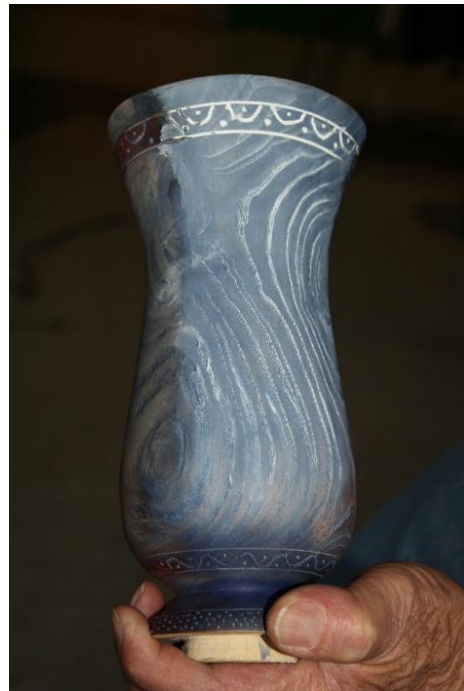
'n Jakarandavaas met "liming wax" slegs op 'n gedeelte aangewend. /Liming wax applied to one side only of a jacaranda vase.

Vir die verduideliking van sy Delft-effek op hout, het Carel die oorsprong van hierdie toepassing vertel en die stappe genoem om die hout soos Delft-porselein te laat vertoon. Die belangrikste stap is die aanwending van "liming wax" op die reeds gekleurde hout.