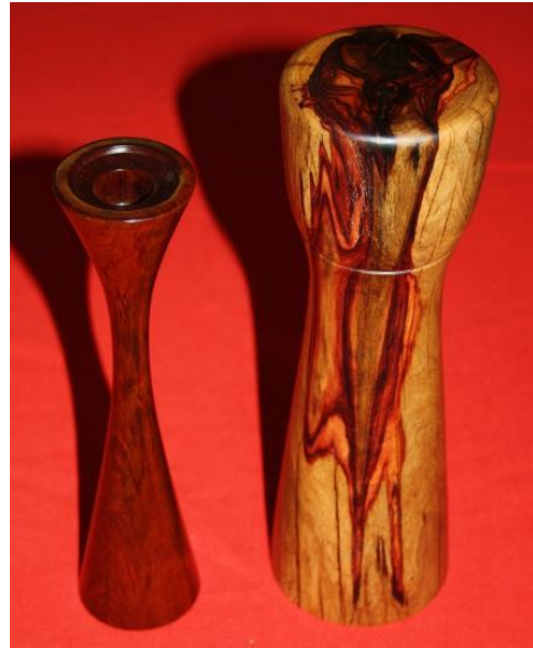
'n Pepermeul van blinkplatboontjiehout met kenmerkende pers strepe in die kernhout. Langsaan is 'n kersblaker volgens die tipiese Ruud Ozolnik-ontwerp waaraan die meultjie se vorm ontleen is. / A pepper grinder from purple wooded flatbean with the characteristic purple streaks in the heartwood. Alongside is a candle holder typical of the Ruud Ozolnik shape that influenced the shape of the grinder.