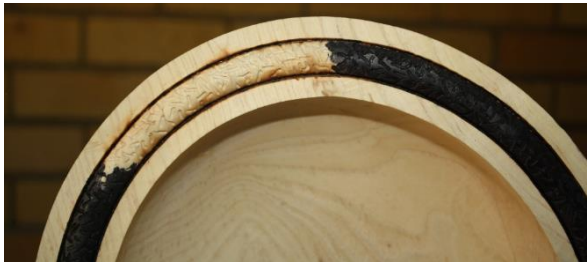
'n Voorbeeld van hoe kleur die kerfwerk op 'n bak se rand kan beklemtoon. / An example of how stain is used to enhance the carved pattern on the edge of a bowl.