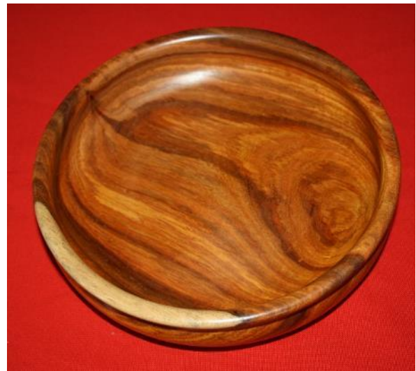
Nico Pienaar se vlak kiaatbak wat met 'n mengsel van byewas en rou lynolie afgewerk is. / Nico Pienaar's shallow bowl, finished with a mixture of bees wax and raw linseed oil.